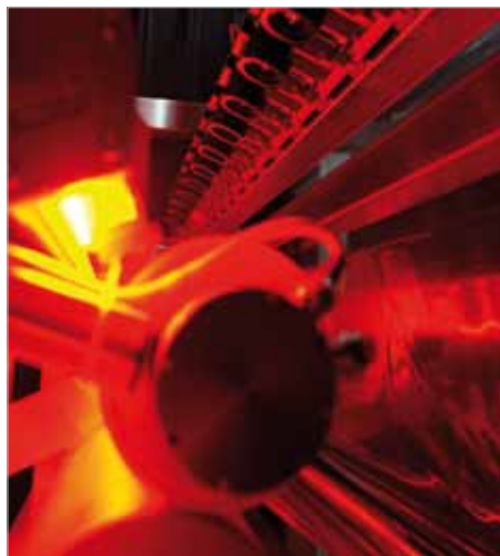
Dr. Schenk solution for cast extruded film

The combination of film extrusion with the cast step is one of the most versatile and prevalent film manufacturing methods. Particularly for sophisticated multi-layer films, cast extrusion is the method of choice. Converting steps, such as stretching, coating, sputtering and laminating, are frequently part of the production line, which commonly runs 24/7 with product changes performed on the fly. At the end of the line, prior to the winder and the automatic roll-cutting system, film inspection must continuously identify a variety of defects and feed this quality information back to each of the diverse production steps.